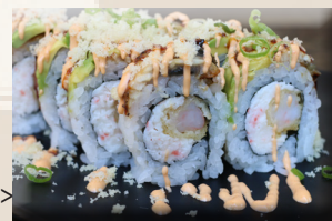
Crazy Dragon >